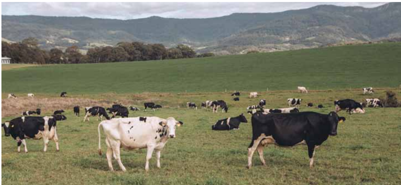
Ebony is building her own herd, Heartspring Holsteins, and dreams of showing Red and White Holsteins. She uses the Good Bulls Guide App to select for type traits, comparing bulls that have the traits she likes with what is at the top end of the BPI

The AI course was also an introduction to learning how to understand BPI and Australian Breeding Values (ABV) and how to compare bulls.